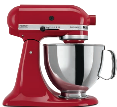
KITCHENAID® ARTISAN® STAND MIXER, $369.99, KITCHENAID.CA

*Instant Savings (before tax) and rebate values (after tax) are dependent on qualifying KitchenAid® countertop appliances. Only valid for Canadian orders on KitchenAid.ca from November 24 - December 8, 2019. While quantities last. Cannot be combined with other offers, discounts, rebates and promotions. Eligible rebate claim must be received by February 2, 2020 or will be void. Visit kitchenaidpromos.ca to redeem. GST/HST/QST and applicable provincial sales tax (where applicable) are included in the rebate amount. Limit 1 per order. Must have a stand mixer in the shopping cart and the Stand Mixer Cover (KMCCTER) must be added to cart separately. © 7th © 2019 KitchenAid. Used under license in Canada. All rights reserved. The design of the stand mixer is a trademark in the U.S. and elsewhere.