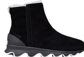
ECCO, $250, CA.ECCO.COM

The sole of this pair of waterproof suede boots resembles a running shoe—albeit a super futuristic one.