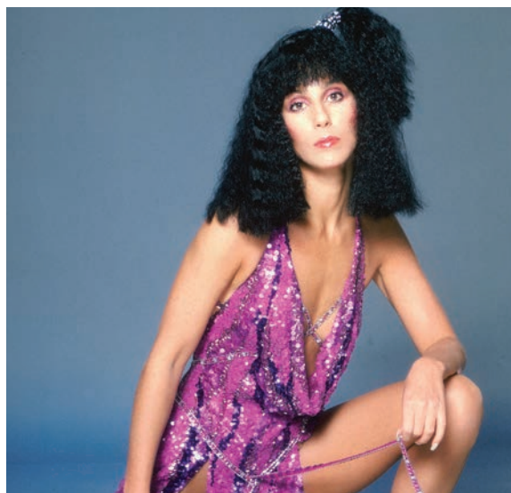
A little razzle-dazzle The fascinating history of the sequin PAGE 4