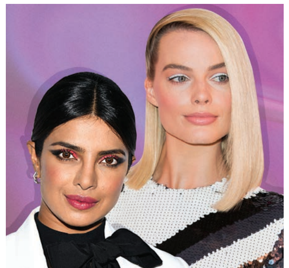
Bright eyes How to knock off Hollywood's hottest makeup look PAGE 7