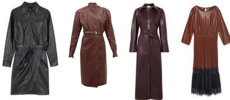
BA&SH, $550, 6BYGEEBEAUTY.COM. DOD BAR OR, $1,540, MATCHESFASHION.COM. NANUSHKA, $899, NET-A-PORTER.COM. ZARA, $100, ZARA.COM

Leather—whether real or faux—is a daytime staple. Flip the script and wear one of these slick dresses at night for a look that's a little unexpected