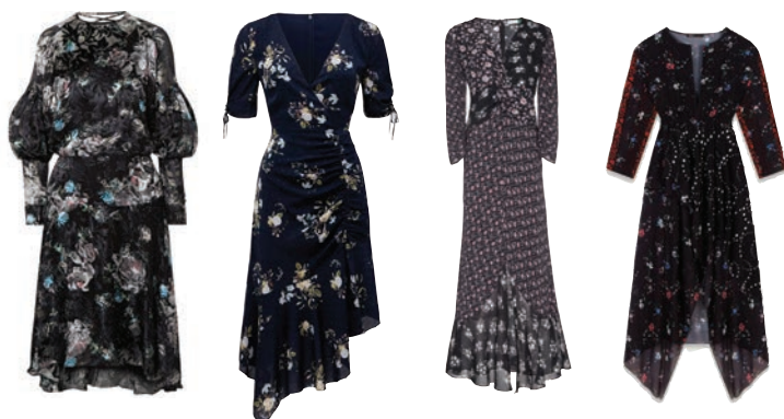
PREEN, $1,011, NET-A-PORTER.COM. EVER NEW, $170, EVERNEW.CA. RIXO, $640, RIXO.CO.UK. MAJE, $548, MAJE.COM

Consider a printed midi the ultimate wear-anywhere dress. Set on a dark background, these moody blooms are anything but saccharine