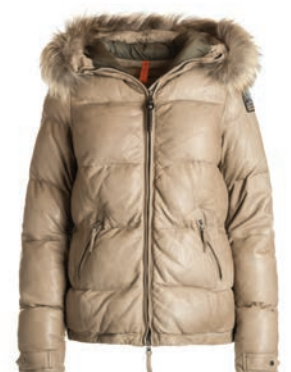
PARAJUMPERS STEPHANY JACKET, $1,245, PARAJUMPERS.IT/CA

It doesn't get more luxurious than super-soft leather. We love the cropped silhouette of this jacket, which looks great with jeans as well as over chic sweater dresses.