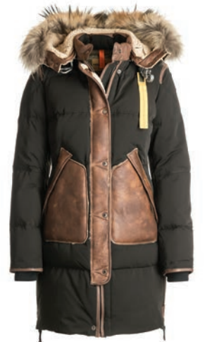
PARAJUMPERS MARIAH B.C. JACKET, $560, PARAJUMPERS.IT/CA

If you favour interesting details and neutral tones, this coat is for you. The special-edition down topper features rugged leather patches and a cozy shearling lining.