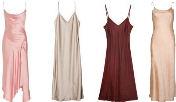
JONATHAN SIMKHAL, $790, MODAOPERANDI.COM. WILFRED, $118, ARITZIA.COM. ORGANIC BY JOHN PATRICK, $250, ORGANICBYJOHNPATRICK.COM. REALISATION PAR, $330, REALISATIONPAR.COM

On the runways slinky slips were paired with everything from tees to trousers. Whether you follow suit is up to you, but do add shoulder-grazing earrings