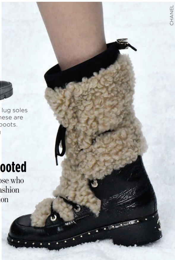
GANNI, $744, SHOPBOP.COM

With their exaggerated lug soles and decorative laces, these are the fashion girl's snow boots.