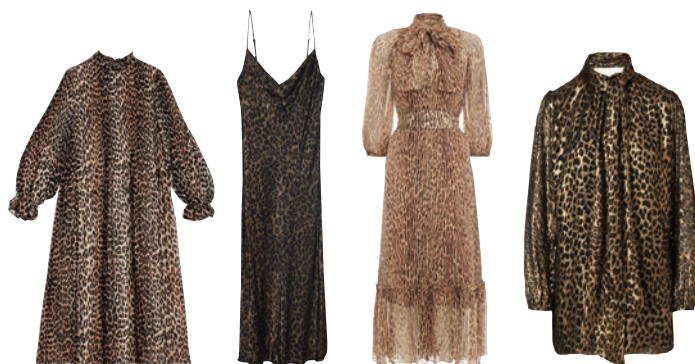
GANNI, $297, BONADRAG.COM. ZARA, $50, ZARA.COM. ZIMMERMANN, $1,520, ZIMMERMANNWEAR.COM. SAINT LAURENT, $3,095, HOLTRENFREW.COM

Animal prints are a perennial classic, but thanks to a jolt of metallics and new silhouettes, they've never felt more of-the-moment