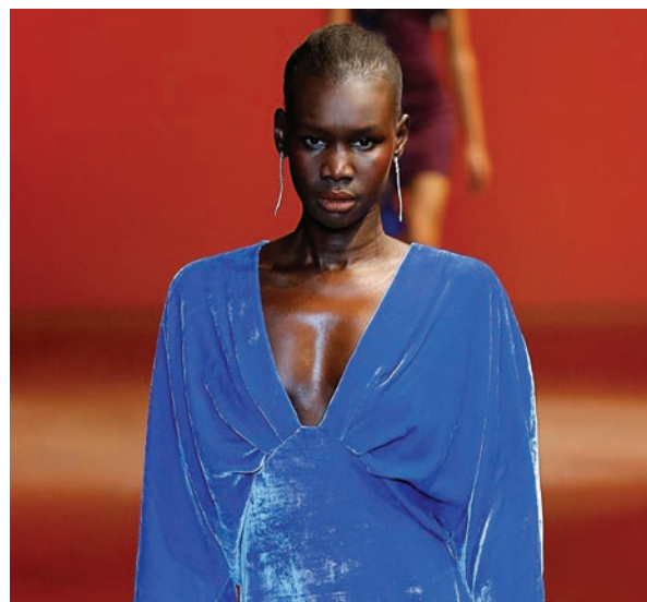
Striding into the holidays like... Our top 20 strut-worthy dresses PAGE 5

KATHRYN BOWEN CORSET, $1,240, KATHRYNBOWEN.COM. H&M BODY-SUIT, $40. PANTS , $40, HM.COM. ALDO SHOES, $120, ALDOSHOES.COM. JEWELLERY , STYLIST'S OWN. HAIR & MAKEUP : KARIMA SUMAR/P1M.CA. STYLING : CHERRY WANG