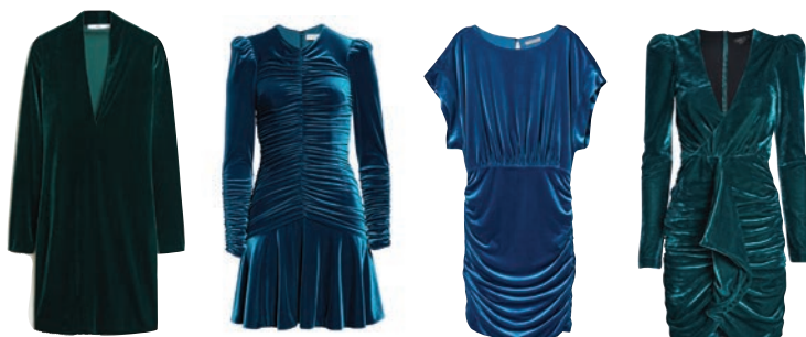
MANGO, $50, SHOPMANGO.COM. MONIQUE LHUILLIER, $549, NORDSTROM.COM. H&M, $60, HM.COM. PATBO, $865, INTERMIXONLINE.COM

Talk about a blue crush. The luxe, lustrous material is the ultimate shortcut to looking holiday-party ready