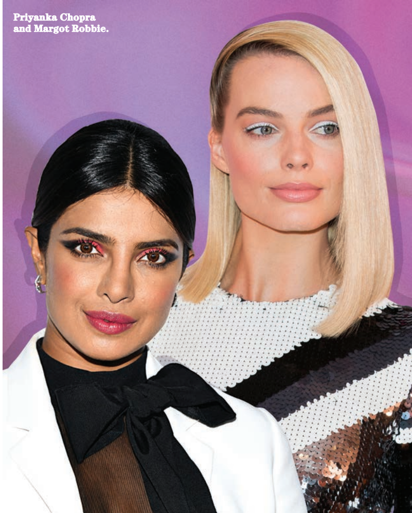
Priyanka Chopra and Margot Robbie.